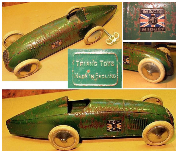
This is the model from the 'for sale' group of pictures.

Also, from the last issue, on the subject of the model of EX127 on the D Type, Mike Dalby (of M Type fame) told me that there is a good picture of the model marketed by Triang Toys at the time on page 110 of Mike Ellman-Brown's book 'The Complete Guide to MG Collectables' By co-incidence, some of you might have seen, one of these models was 'for sale' on the Triple M Register forum and was very quickly sold.